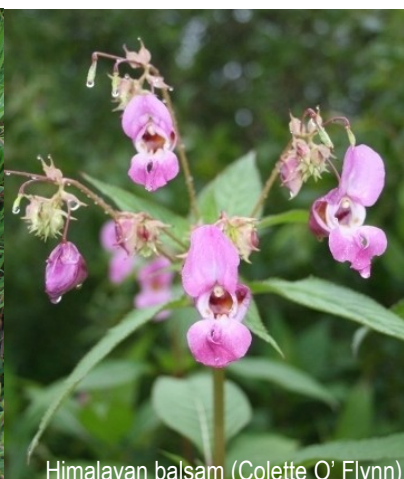
Himalayan balsam (Colette O' Flynn)