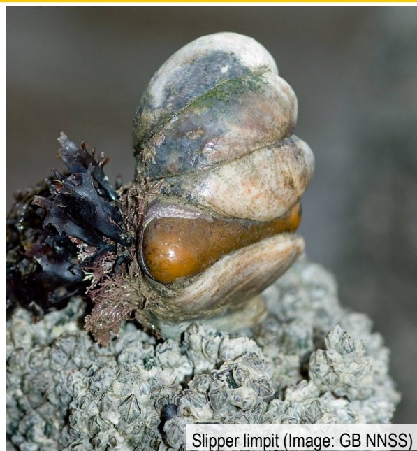
Slipper limpet

The Regulations do not state that the population must be known to the person moving the mussel seed. It is likely that ignorance of the distribution of Crepidula fornicata could not be used as a defence.