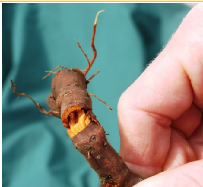
Rhizome of Japanese knotweed (Image: Cornwall knotweed Forum)

http://invasives.biodiversityireland.ie/id-sheets/