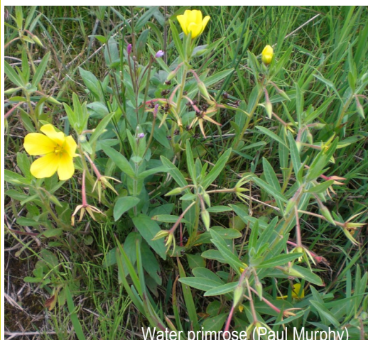
Water primrose (Paul Murphy)