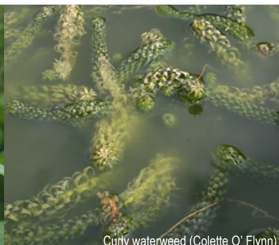
Curly waterweed (Colette O' Flynn)